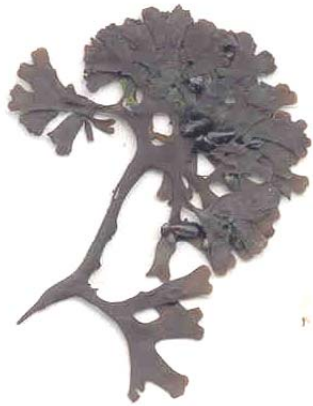
Chondrus crispus Irish Moss