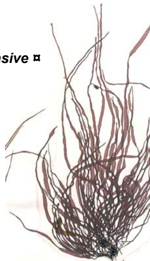
Dumontia sp. Dumont's Red Weed