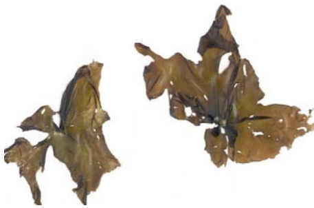
Porphyra sp. Laver