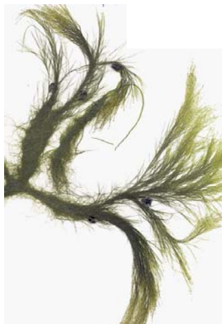
Acrosiphonia sp. Green Rope Weed