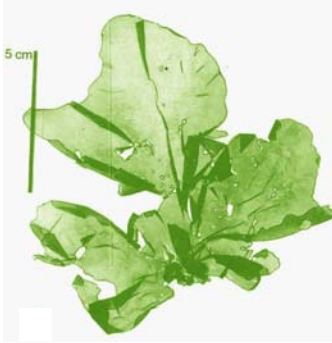
Ulva lactula Sea Lettuce