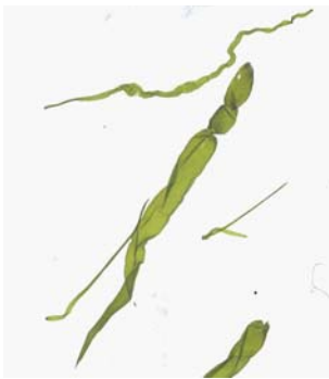
Enteromorpha sp. Hollow Green Weed