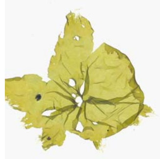
Monostroma sp. Thin Sea Lettuce